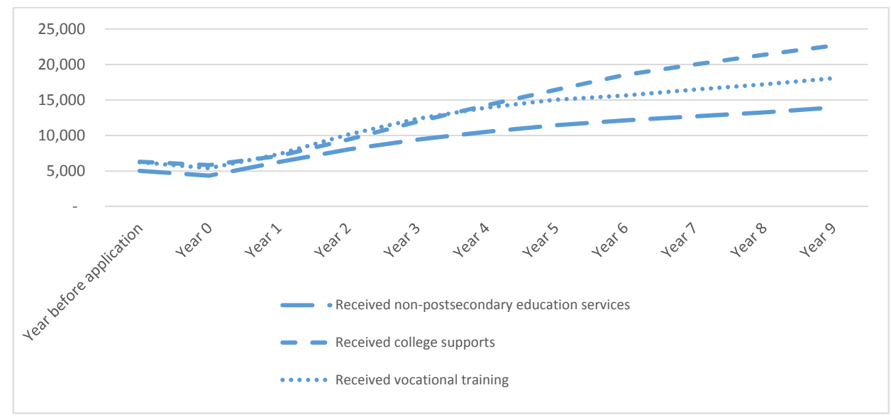
Figure 2. Average earnings of employed VR youth clients with MHCs, by type of service received

Our regression analyses show that youth with MHCs who receive college or vocational training support or employment services are about 5 percentage points more likely to have been employed at any point in the nine years after VR application than are those who received other types of VR services. Furthermore, those who received postsecondary education support and were employed at any point are likely to have more years of employment during the nine years after VR application compared with employed youth with MHCs who received other types of supports. Youth with MHCs who receive college supports are also much more likely to be employed in the ninth year after VR application than are those who received other types of VR services, and the average earnings of those who are employed that year are significantly higher than the earnings of employed youth with MHCs who received other types of VR services. Receiving vocational training has a lesser effect on employment and earnings in the ninth year after VR application, but it is still larger than the effect of receiving other VR services besides college support.