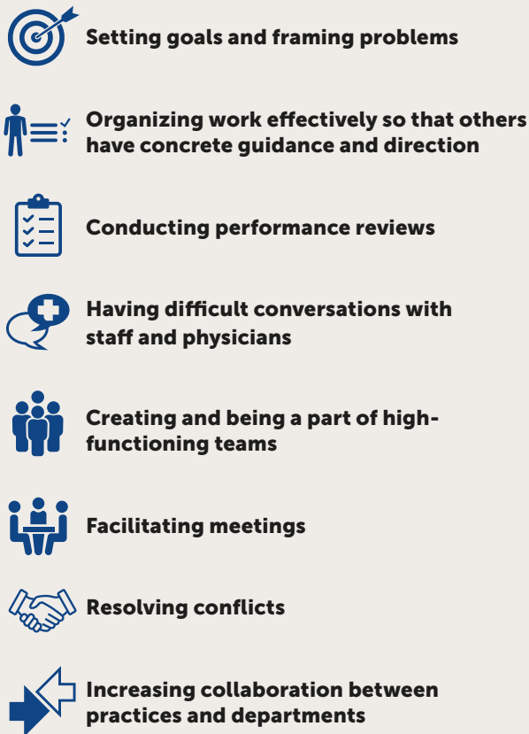
Figure 2 Examples of Topics in the Leadership Academies