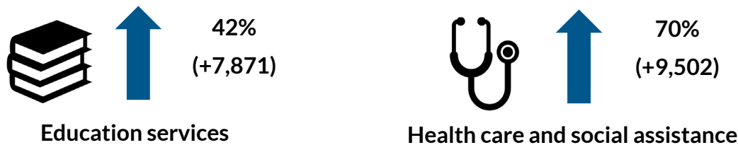
FIGURE 3 National Increases in the Number of Registered Apprentices in Select Nontraditional Industries from 2019 to 2022

Although states expanded apprenticeship programs to nontraditional industries, such as information technology and health care prior to the pandemic, state administrators described accelerating expansion during the COVID-19 pandemic in response to employer demand and staffing shortages. 20 According to RAPIDS, nationally, from 2019 to 2022 the number of active registered apprentices increased in several nontraditional industries, including education and health care and social assistance (figure 3). Three state staff noted that the pandemic accelerated their expansion into health care and education because of the increased nursing and teacher shortages resulting from the pandemic. One state administrator noted, “We have seen a big decline in the [jobs in the] health care industry during COVID because of the strain put on the health care system, the nurses, the doctors, but it also demonstrated our need to reach out and grow new apprenticeships in health care.”